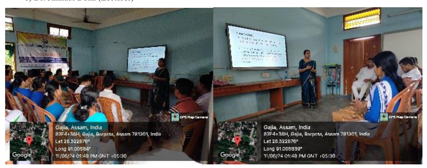
ii. TWO DAY WORKSHOP ON YOGA